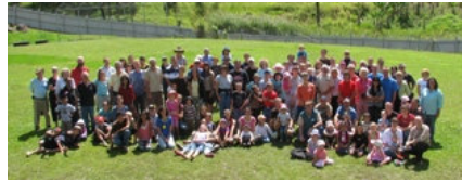
MAF PNG family @ ICU 09