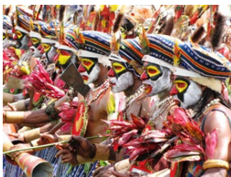
Mt Hagen Cultural Show