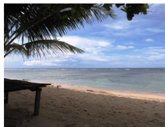
Base G Beach, Papua

der. We were going where the people don't speak