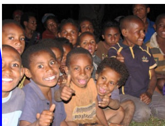
Kids @ Kenta Lutheran Church during MAF ministry program