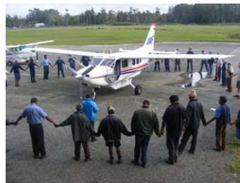
Arrival of the second new GA8 Turbo

times for me. I sat my last airframe exam with very little preparation and failed back in August. I was able to resit it in Port Moresby during October and passed. The following week I sat PNG air law and passed. My airframe licenses application has