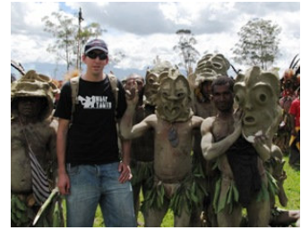
Hang'n with some Goroka mudmen