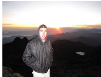
Sunrise (I left my beanie behind)

continued to push on without really stopping. We came to Christopher's corner around 0500. We decided to stay and watch the sun rise, it was quite cold at this point. After the sun came up we kept hiking and made it to the summit just before 0700. It was an amazing sight, we had a clear sky and view all the way to the coast. We only spent thirty minutes if that at the summit, as rain clouds were evident lower down. Again my knees were in pain coming down. It was amazing to see what we had hiked along coming up and pasted in the dark. We made it back to base camp around 1130. Then back to the lodge that night, a lot of hiking in one day. Returning home on Monday. It was a great experience to finally climb Mt Wilhelm and I found it easier than that of Mt Hagen.