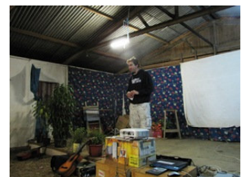
Sharing my testimony @ a MAF ministry program